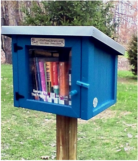
@ Veterans Park

Now in our 9th year, and in partnership with the cities of Mentor and Mentor-on-the-Lake, and area businesses, Mentor Public Library's Little Free Libraries (LFLs) have become a destination at many of our area parks.