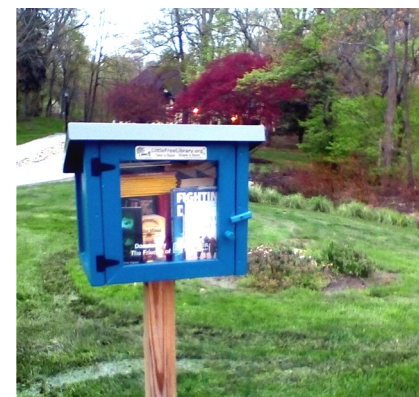
@ Wildwood Cultural Center and Park