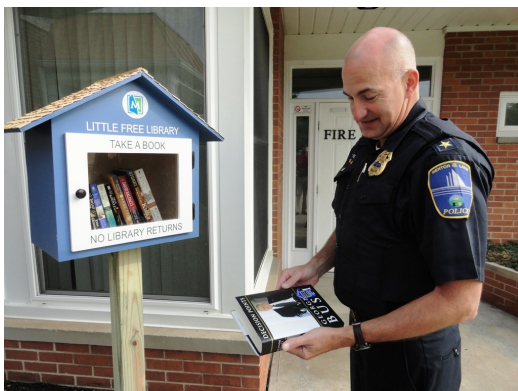
@ MOL City Hall

“Mentor Public Library is your community library. We foster lifelong enrichment by providing materials, services, and programs for literacy, learning, and pleasure in an environment of intellectual freedom and confidentiality.”