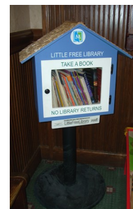
@ Yours Truly Restaurant